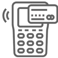
Point of sale terminals